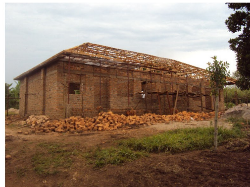
Above- Securing trusses for the roof!