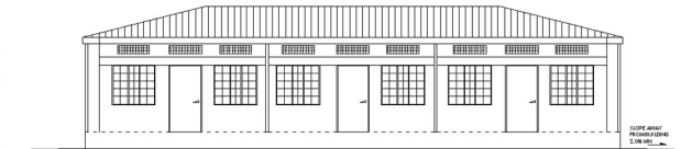
FRONT ELEVATION - LEVEL GROUND