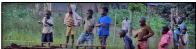
Children from the village watching construction