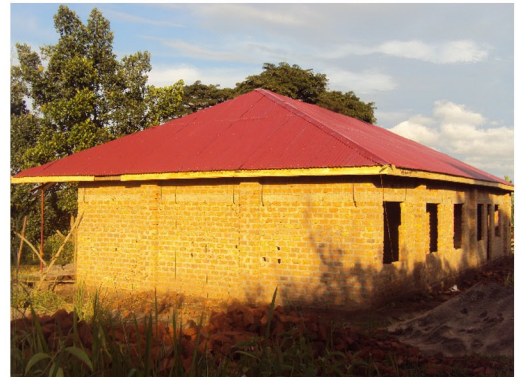
Above: Finishing the roof!