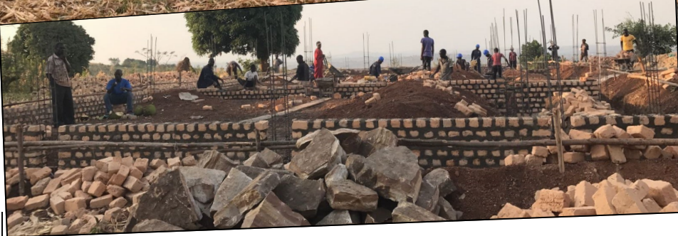
Primary School Building Begins!

While visiting the land, on January 19, 2017, Mathias signed a contract with a builder in Uganda to begin construction on the first phase of the Primary School. The first phase will include grading the site, construction of a Netball Court, building outside latrines, and constructing a building which will house three classrooms and one multi-purpose room. Foundation work began on January 21st. The land grows several fruit trees and offers an amazing view of the valley. We anticipate a total of four phases in order to complete the entire school complex. Pray for smooth authorization of government documents by the Ministry of Education. This is an exciting addition to our first children's homes which were completed in 2016. Additionally, a new asphalt road has been paved to the village of Namuganga. No more dodging holes in the road!