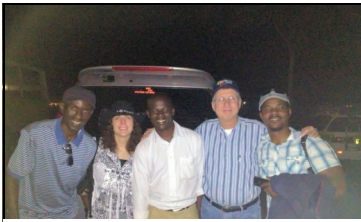
Weary Travelers Arrive in Uganda