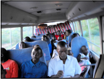
Bus of Sponsor Kids Fully Loaded!