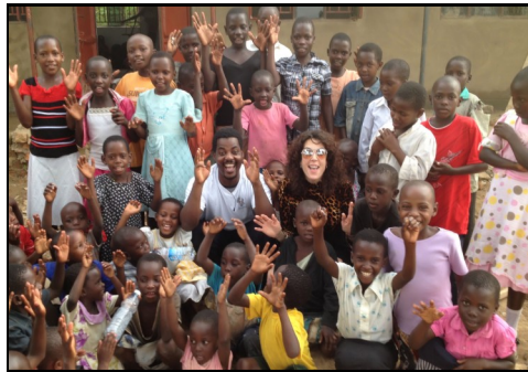
Spending Time with Kids During Our Outreach