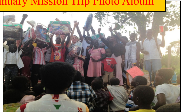
Sponsor Children Gift Distribution - a Celebration!